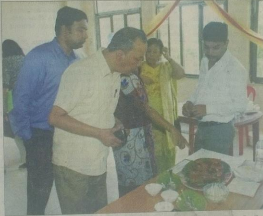
Sports and youth affairs minister Zenith Sangma, Tura ICFAI University-o Sonibar salo ong-atanggipa food festival-ni somoio song-gimin cha-anirango nienga.

"Garo Hillsni bitakani cha-ani ringanion ong-a