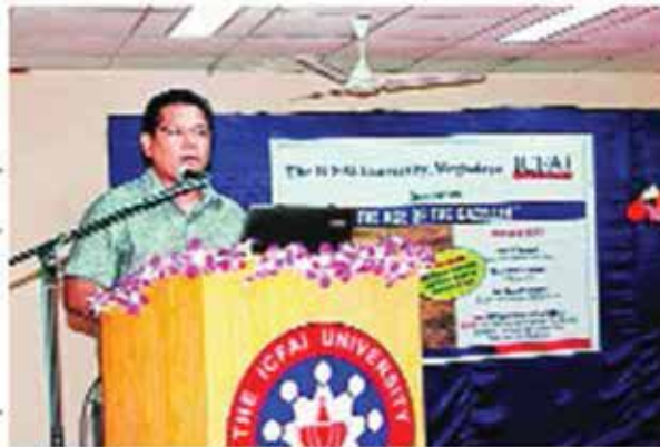
Conrad Sangma at Tura on Wednesday

Tura, Sept. 23: Entrepreneurship and the need to create an environment conducive to business was the focus of a seminar organised by The ICFAI University Meghalaya on its campus here today.