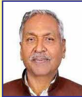
Shri Phagu Chauhan Hon'ble Governor of Meghalaya (From 13-02-2023)