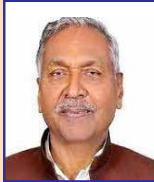
Shri Phagu Chauhan Hon'ble Governor of Meghalaya (From 13-02-2023)